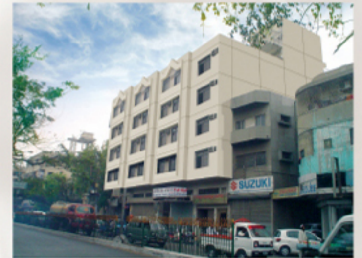
Frere Business Centre